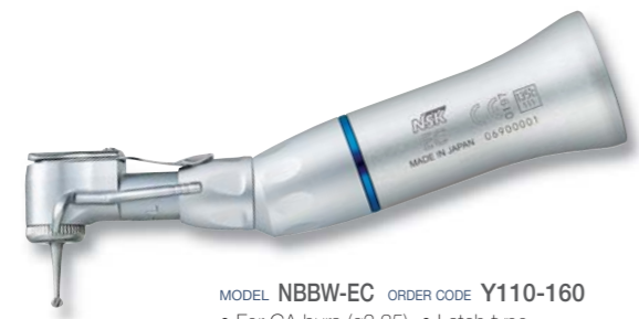
MODEL NBBW-EC ORDER CODE Y110-160 • For CA burs (ø2.35) • Latch type • With Water Nozzle