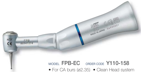
MODEL FPB-EC ORDER CODE Y110-158 • For CA burs (ø2.35) • Clean Head system • Push Button Chuck