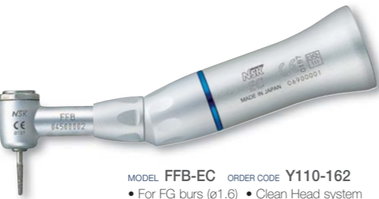
MODEL FFB-EC ORDER CODE Y110-162 • For FG burs (ø1.6) • Clean Head system • Ultra Push Chuck