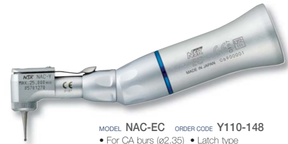
MODEL NAC-EC ORDER CODE Y110-148 • For CA burs (ø2.35) • Latch type • Max. 25,000 min -1