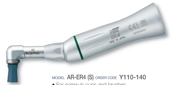
MODEL AR-ER4 (S) ORDER CODE Y110-140 • For screw-in cups and brushes