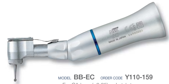
MODEL BB-EC ORDER CODE Y110-159 • For CA burs (ø2.35) • Latch type • Max. 40,000 min -1