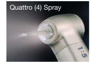
MODEL Ti95EX ORDER CODE C487 • Solid Titanium Body • For FG burs • Max. 200,000 min -1 • Ceramic Bearings • Clean Head system • Ultra Push Chuck