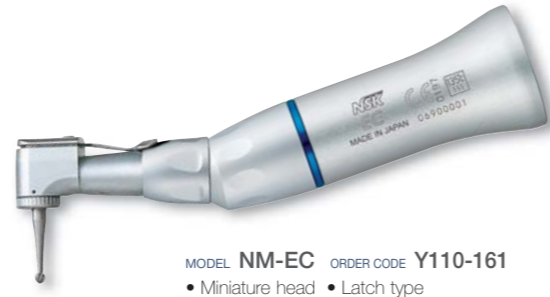
MODEL NM-EC ORDER CODE Y110-161 • Miniature head • Latch type • For CA burs (ø2.35 Short Shank) • Max. 30,000 min -1