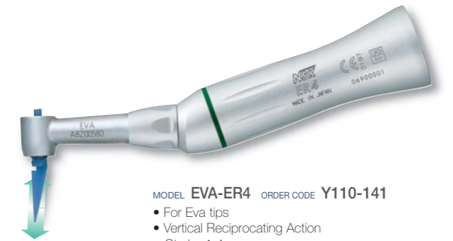
MODEL EVA-ER4 ORDER CODE Y110-141 • For Eva tips • Vertical Reciprocating Action Stroke 1.4 mm

All handpieces and air motors can be sterilised up to 135°C.