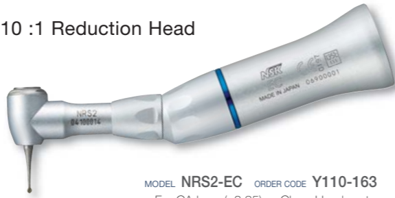
MODEL NRS2-EC ORDER CODE Y110-163 • For CA burs (ø2.35) • Clean Head system • Push Button Chuck