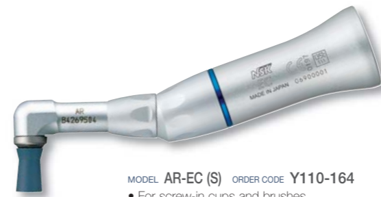
MODEL AR-EC (S) ORDER CODE Y110-164 • For screw-in cups and brushes