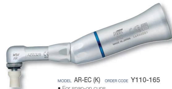
MODEL AR-EC (K) ORDER CODE Y110-165 • For snap-on cups