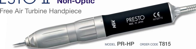
MODEL PR-HP ORDER CODE T815