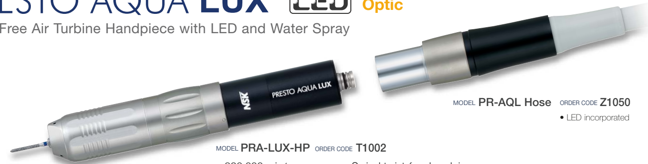
MODEL PR-AQL Hose ORDER CODE Z1050 • LED incorporated

Lube Free Air Turbine Handpiece with LED and Water Spray